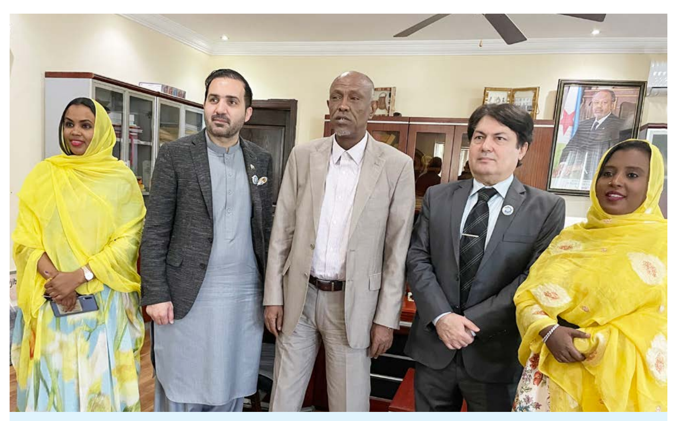
Figure No.4 - Delegation with the Minister of Commerce/Trade Mr. Hassan Houmed Ibrahim