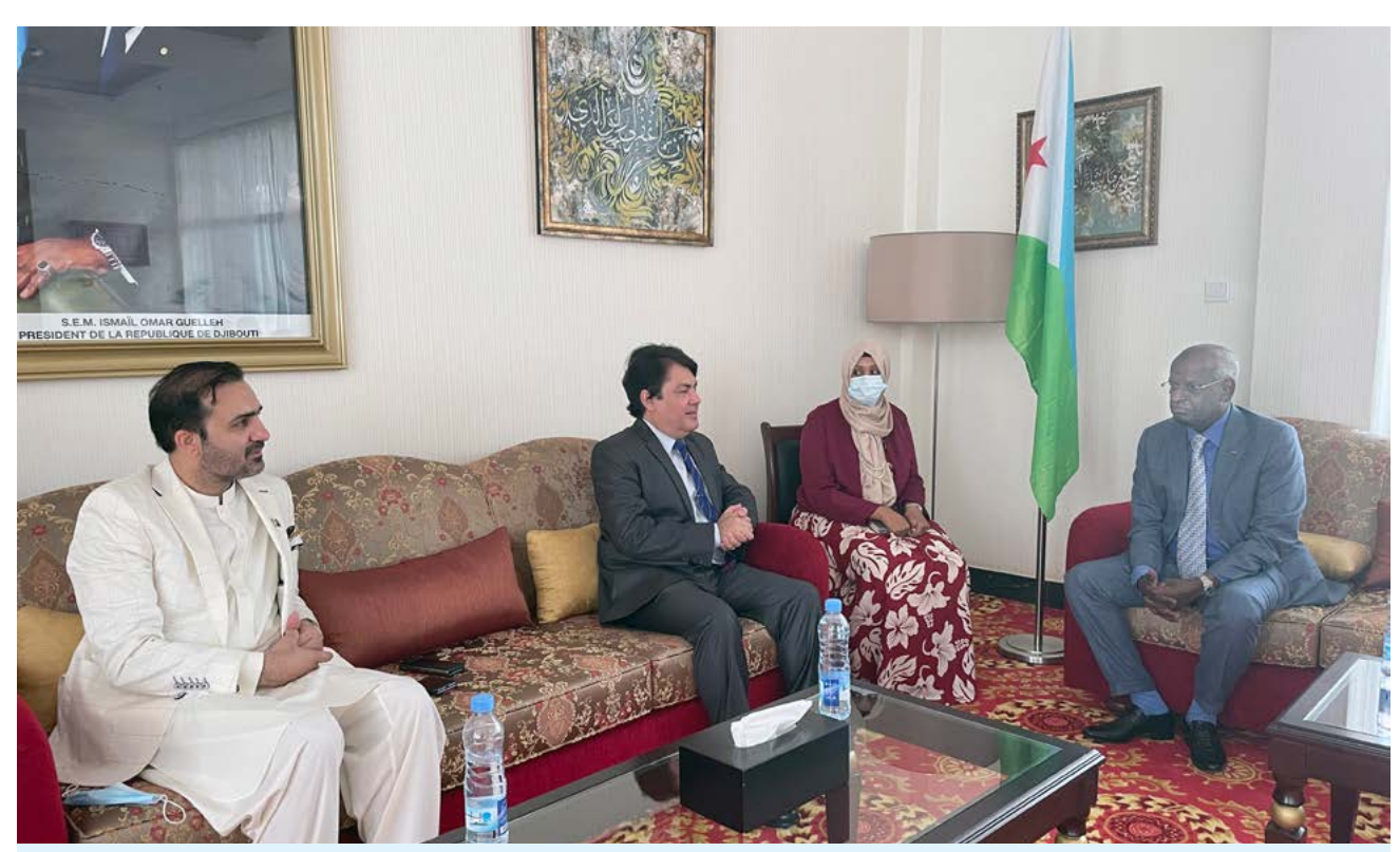
Figure No. 12 – IPC Delegation with the Prime Minister of the Republic of Djibouti Honorable Mr. Abdoulkader Kamil Mohamed.