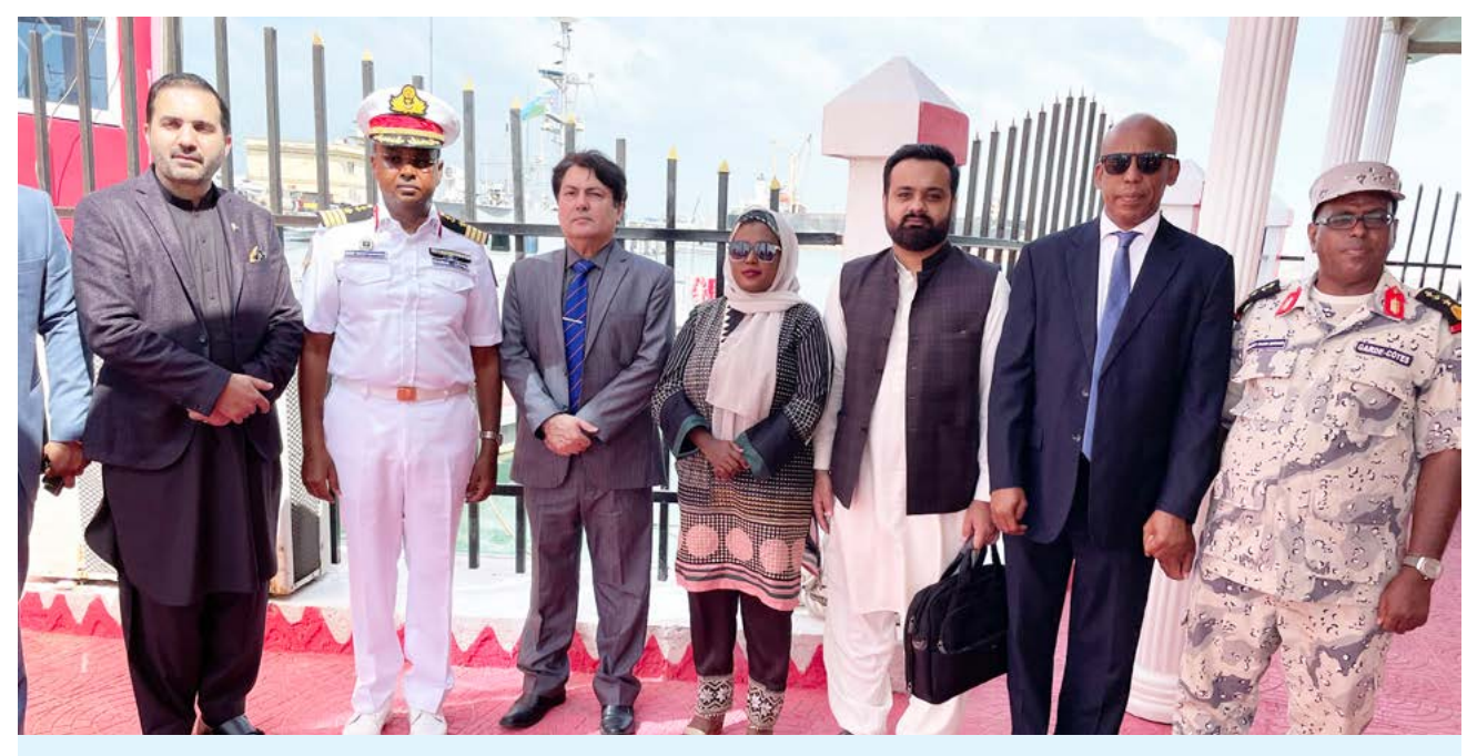
Figure No. 8 Delegation with Commander of Coast Guard Djibouti Colonel, Wais Omar Bogoreh

During the discussion, the Chief of Staff of the Djiboutian Navy Commander Ahmed Djama expressed his interest in deepening diplomatic relations between the countries and in particular highlighted the enhancement of bilateral ties between the naval forces of both countries.