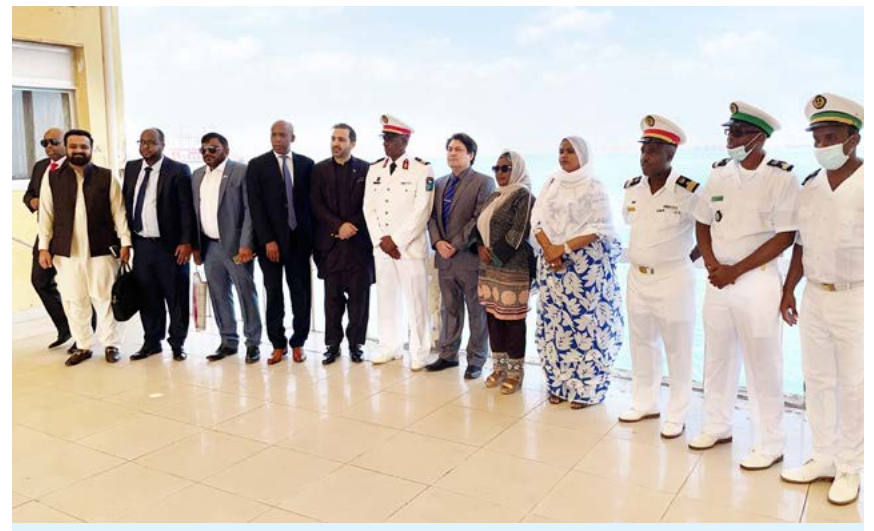
Figure No. 7 – IPC Delegation with Chief of Staff of the Djiboutian Navy Commander Ahmed Djama.

On the third day of the visit, the IPC delegation was warmly welcomed by the Chief of Staff of the Djiboutian Navy Commander Ahmed Djama in the Naval Headquarters on Djibouti port.