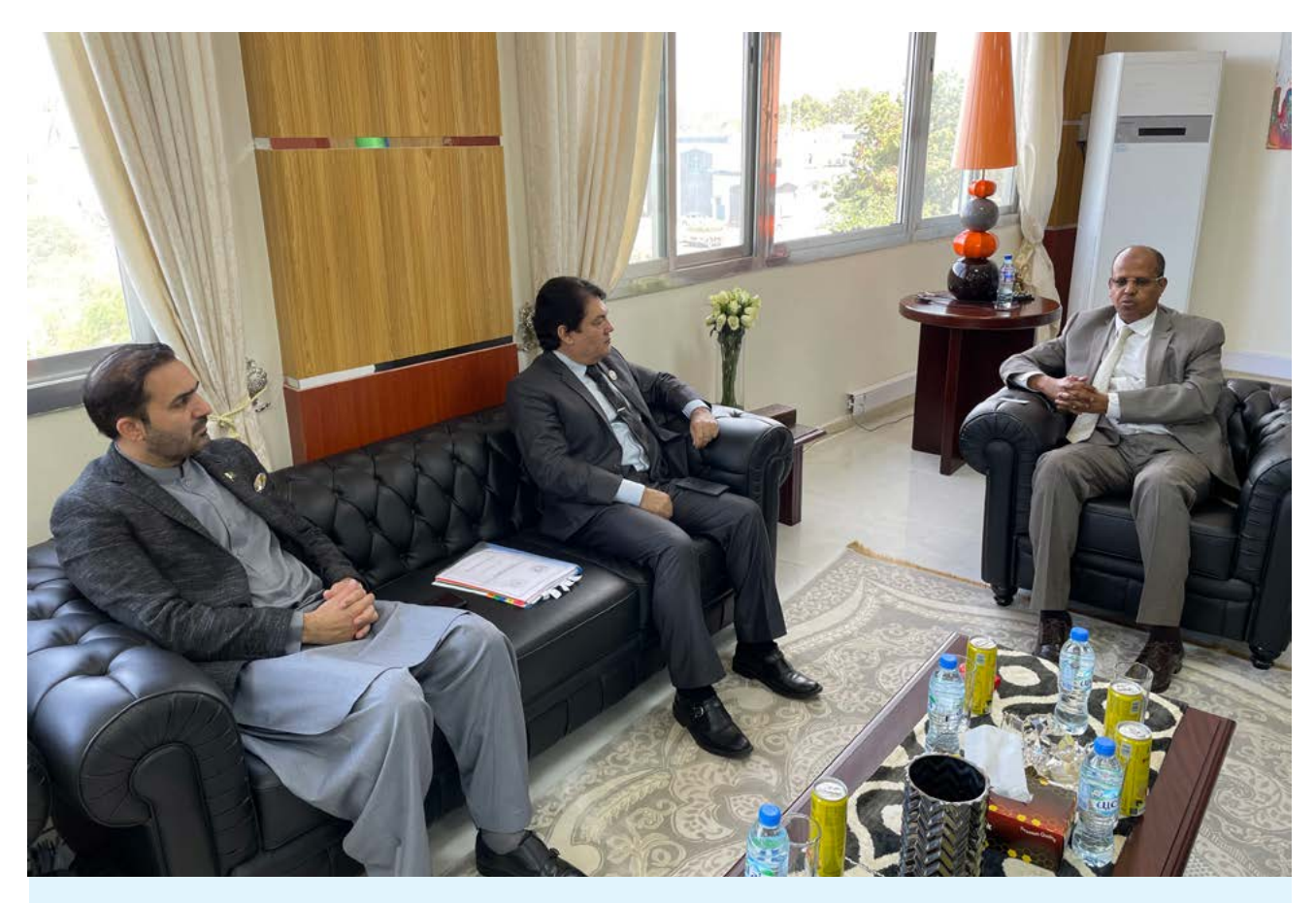
Figure No. 6 - Meeting with the Minister of Foreign Affairs Honorable Mr. Mahmoud Ali Youssouf