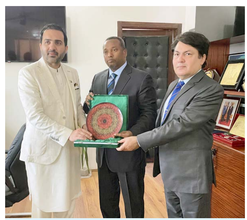
Figure No. 11 - Delegation with Minister of Energy of the Republic of Djibouti Mr. Younis Ali Guedi

The Head of the IPC delegation Hon. Senator Muhammad Ali Saif gave him a brief on Pakistan's solar and hydropower energy project and expressed interest of investment in Djibouti from Pakistani energy sector investors. The idea was very well received by Mr. Geudi, who discussed plans to sign a Memorandum of Understanding (MoU) between Pakistan and Djibouti for investment in the energy sector. He also affirmed that energy tariffs are very high in Djibouti which the government is working to bring them down as to make it more accessible for the general public.