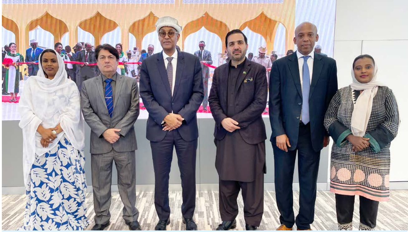
Figure No. 9- IPC Delegation with Mr. Aboubakaer Omar Hadi, Chairman of Djibouti Ports and Free Zones Authority

The delegation members were also given a visit to various port infrastructure sites.