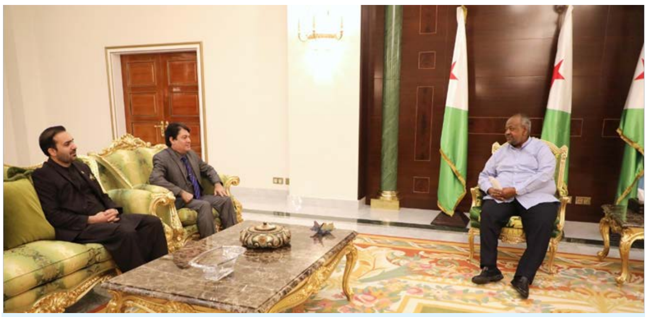
Figure No. 10- IPC Delegation with the Head of The State, Republic of Djibouti Honorable Mr. Ismail Omar Guelleh.