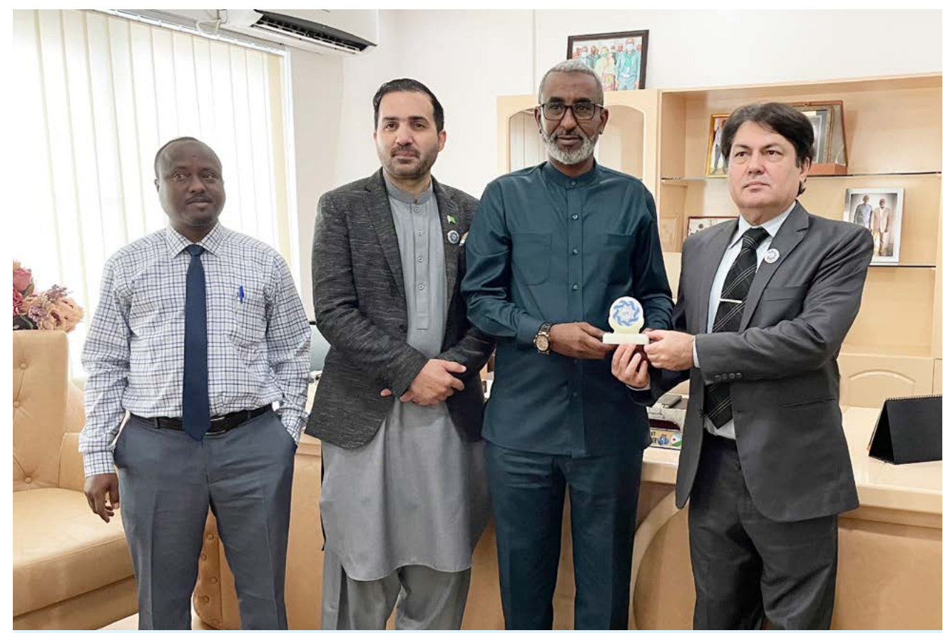
Figure No. 5 - Secretary-General IPC presenting a shield to the Minister of Budget Mr. Abdoulkarim Aden Cher